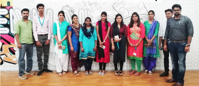
Students selected for Internship at Societe General with a stipend of ₹22,000 per month.