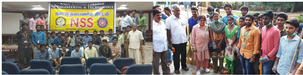
The NSS wing of RGCKET celebrated World Earth Day by cleaning the Botanical Garden on 22 nd April 2018 with the Lieutenant Governor of Puducherry, Dr. Kiran Bedi. Two areas at the garden have been allocated for our college for maintenance.