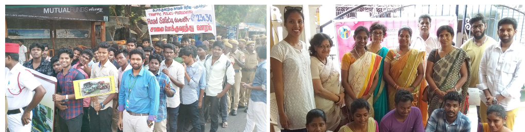
Our students marched a Rally from Puducherry Bus Stand to Gandhi Statue (Beach), Goubert Avenue, Puducherry. The rally was organised with Puducherry Traffic Police department in accordance with celebration of Road Safety Week on 26 th April 2018 which was inaugurated by our honourable Chief Minister Shri. V. Narayanasamy.